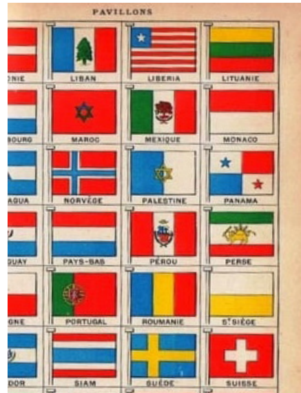
This flag of Palestine (third row down), found in the above 1939 edition of the French encyclopedia, Nouveau Petit Larousse Illustré , shows that it was recognized as a Jewish entity even then. 1

Britain immediately turned over 77% of the Mandate to the Arabs to create Jordan but remained generally committed to establishing a Jewish